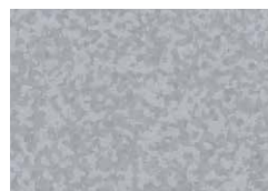
Cool ZINCALUME® Plus